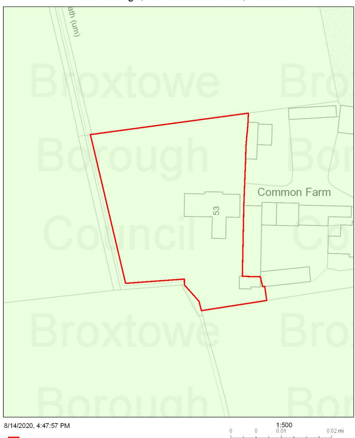
Rose Cottage, 53 Awsworth Lane, Cossall